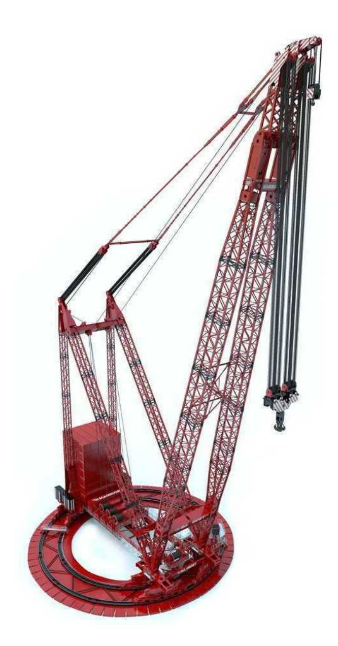
The PTC 140 crane.