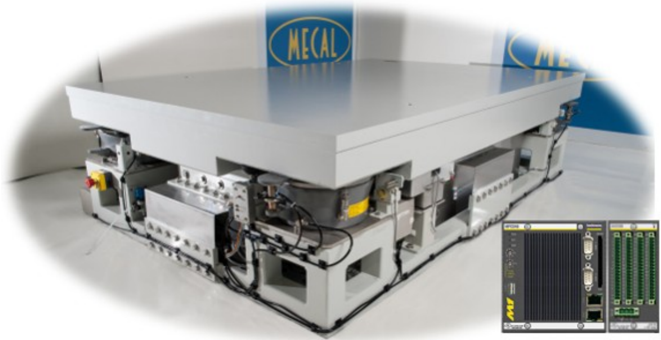
The TS-7300 computer with IO.

In a series of quick iterations, controllers were designed and tested. Measurements showed that the concepts did work as expected.