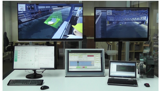
The HIL simulator setup.

Controllab is the developer of 20-sim, a package for the modeling and simulation of machines like MARIN's towing carriage. Controllab has created an extension to the package that allows it to be coupled to PLC systems like the Siemens Simotion Controller. The extension takes care that variables are