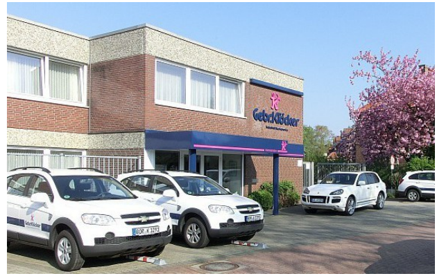
The company Gebr. Klöcker GmbH.

Stepper motors are traditionally driven step by step, with sufficient time between steps to damp out vibrations. Controllab created a dynamic model of the power electronics, stepper motor and load. With this model